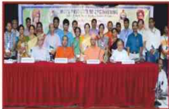
One Day seminar on "Value Education & Positive Thinking" held on 31/07/16