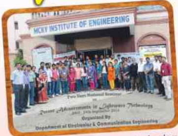
National Seminar on Lightwave Technology held during 23-24 September, 2017