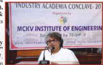
"Industry Academia Conclave 2017" held on 10/02/17

Successful engineering is all about understanding how things break or fail.