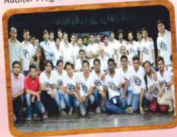
PRAGATI - 2016 held during 06-07 May, 2016