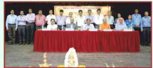
Orientation Programme held on 14/09/16

◆ MOU signed with Govt. College of Engineering & Textile Technology, Berhampore on 5 th August, 2016 towards mutual exchange of students for training, exchange of faculties, seminars, conferences and other relevant programmes including research & consultancy.