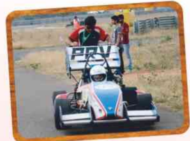
Formula Bharat, 2017 Event held during 25-29 January, 2017