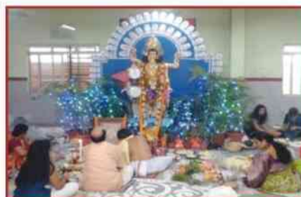
Viswakarma Puja celebration on 17/09/16