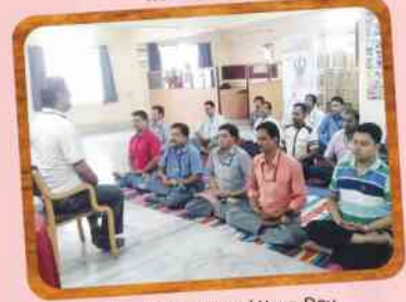
The International Yoga Day was celebrated on 21/06/16