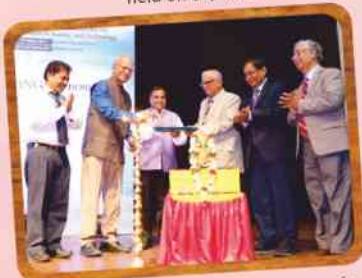
International Conference on Advances in Science and Technology "ICAST" held during 17-19 March, 2017