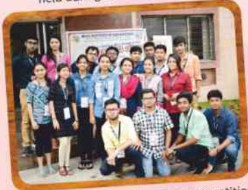
"Quizzare" an intra-college Quiz competition held on 07/04/17