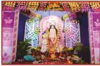
Celebration of Saraswati Puja