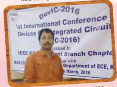
DevIC-2016 held on March, 2016