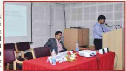
Workshop held on 24-25 February, 2017