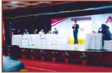
"Auto Quotient by MAHINDRA" held on 24/03/17