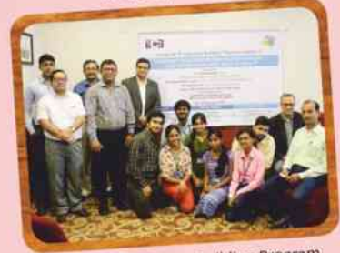
Indian IETF Capacity Building Program held on 13/08/16