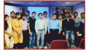
Workshop on "Medical Systems and Imaging" held during 01-02 October, 2016