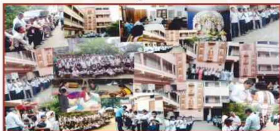
SVCPT, MCKVIE organized one Outreach Programme and donated few utility items to needy children on 04/10/16