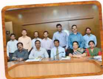
IRCA UK Approved ISO 9001:2015 QMS Lead Auditor Program held during 04 - 08 April, 2016