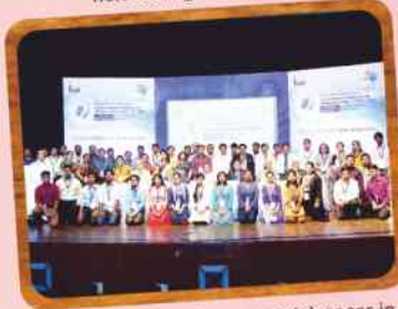
International Conference on Advances in Science and Technology "ICAST" held during 17-19 March, 2017