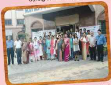
Symposium on "Vision Smart India 2017" held on 29/04/17