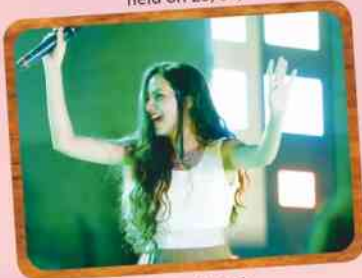
UTOPIA-2017 held during 12-14 May, 2017