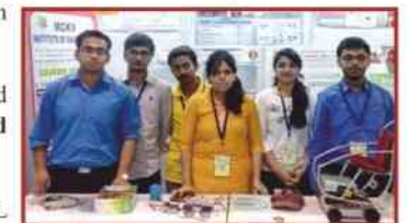
"Wheel Chair on Power"