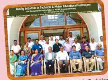
Workshop on "Quality Initiatives in Technical & Higher Educational Institutions" held during 07-09 September, 2016