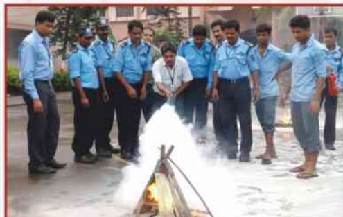
A Fire Fighting mock Training held on 31/08/16