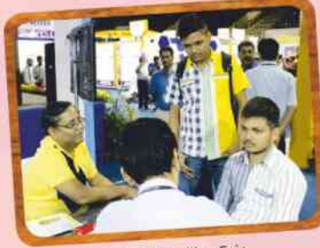
Pre-Counselling Fair held during 09-12 June, 2016